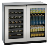
INTEGRATED FRAME (STAINLESS HANDLELESS PANEL)*