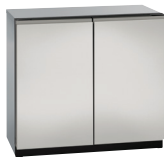
INTEGRATED SOLID (STAINLESS HANDLELESS PANEL)*