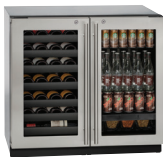
STAINLESS FRAME (LOCK)